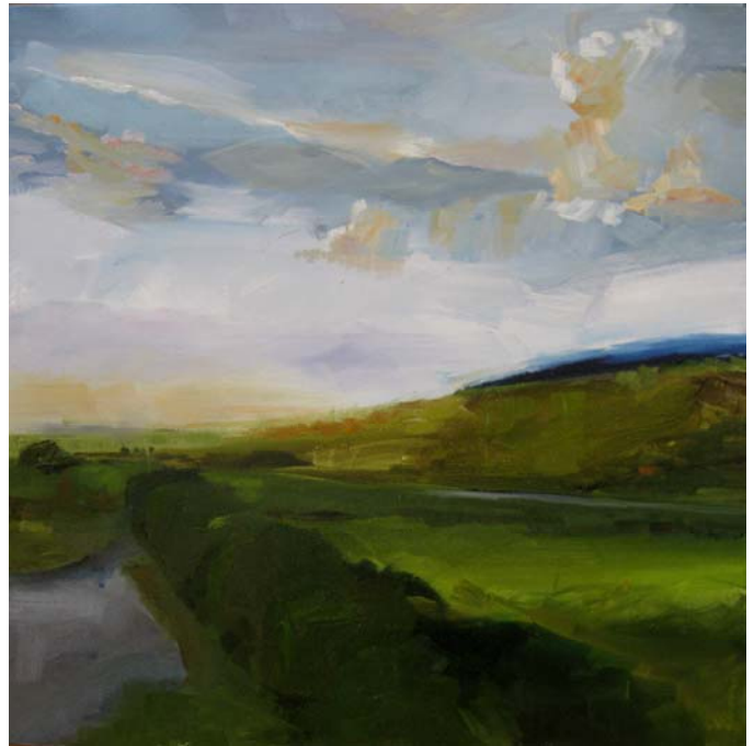
Dixon Observation Field at Dusk, oil, 2011

I was born and raised in Silver Spring, Maryland. I worked for ten years as a general contractor prior to starting a family in 1999. In 2002 I decided to try my hand at pastel painting in Howard County where I currently reside with my husband and two daughters. I immediately fell in love with the creative process and continued on to take classes over the next six years in drawing and painting through the Department of Continuing Studies at both the Maryland Institute College of Art in Baltimore and the Corcoran School of Art in Washington, DC, as well as under private instruction. In 2004 we renovated an old chicken coop in our backyard into the studio in which I currently work. My primary personal goal is to be a homemaker for my family; my primary professional goal is to continue to pursue life as an artist. I enjoy spending time with my family, cooking, canning, finding new music, and being outdoors.